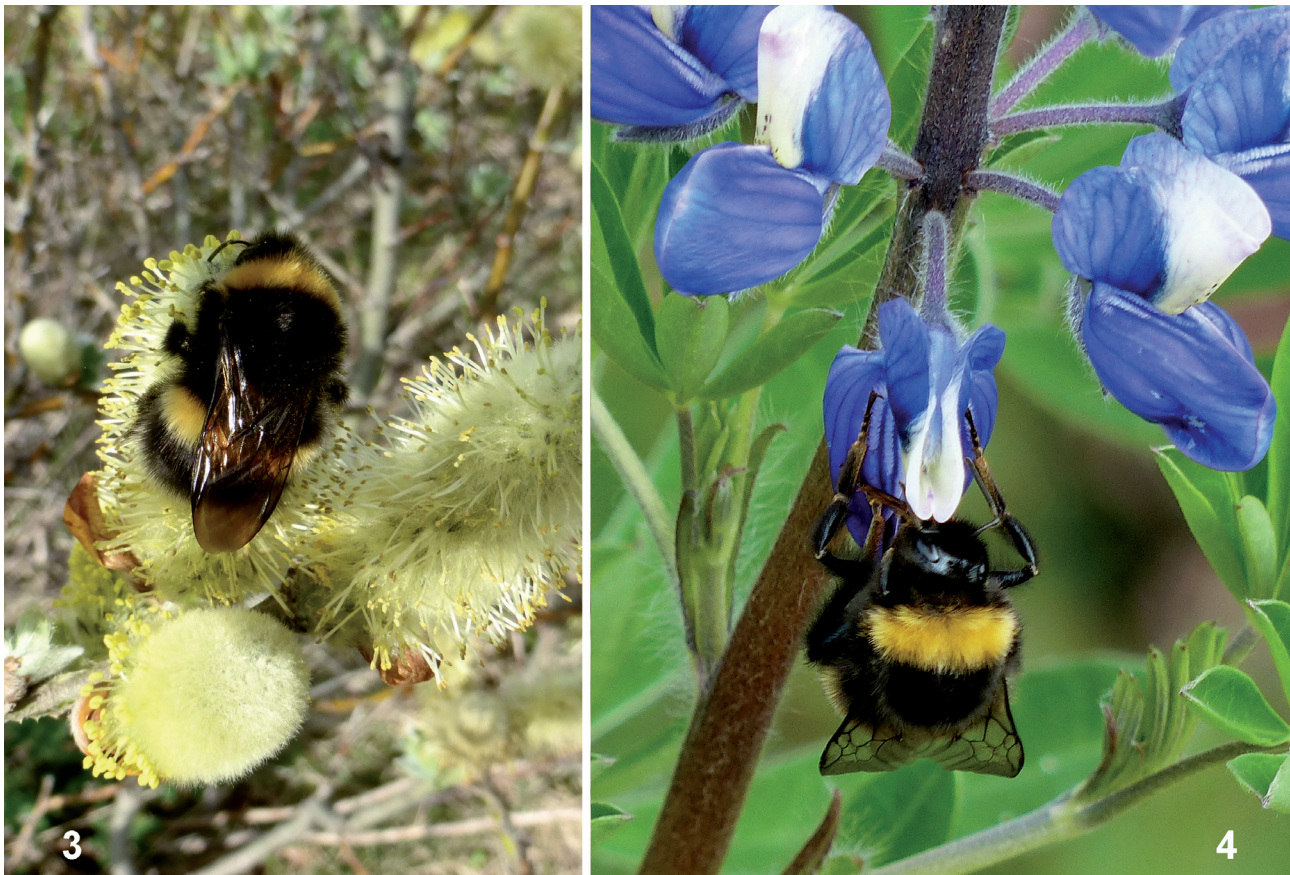
Figs. 3–4. Bombus lucorum queens visiting flowers in Iceland. – 3. Salix lanata (Bakkagerði, Höfn, 4.VI.2014). 4. Lupinus nootkatensis (Húsavík, Laxá, 8.VI.2014).

and snow. If we suppose that 177 grids are not ice- or permanently snow-covered, until today B. jonellus has been observed in 58 grids (33 %).